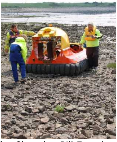
The Clevedon Pill Foreshore

North of Weston there is a private slipway at the Pill, (NOT Pill village on the River Avon) at the Northern end of Woodspring Bay. This has a locked barrier but could be used in an emergency although the foreshore is rocky and there are 20 foot deep gullies at low water.