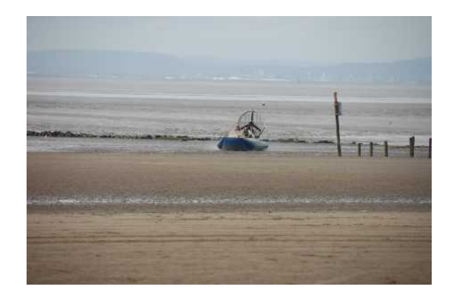
Pipeline and posts.

There is a pipeline crossing the beach that you will have to go round at low tide – this is deceptive from seaward. Take care.