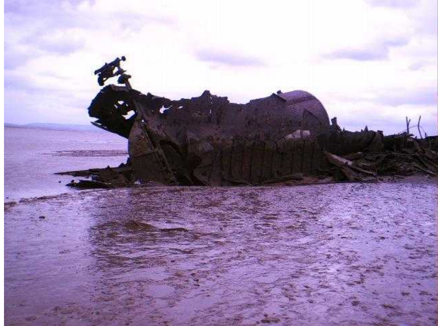
Historic Wreck – Woodspring Bay

Channel is Brean and Burnham and beyond Bridgwater. That's the good side.