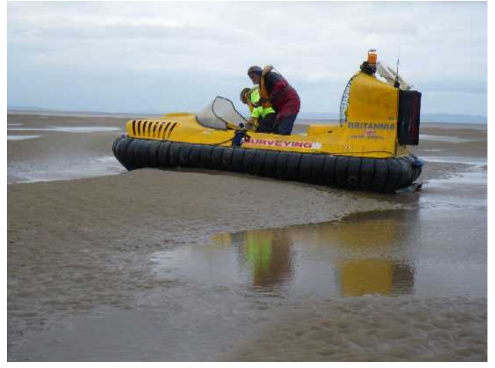
Ridges and quicksand in mid channel

If you stop on the mud flats, the tide may well come in and pass you in a matter of seconds. Also it is very difficult to determine where the mud ends and the water begins. Be aware that mud will have a different amount of drag and may cause the bow to drop and plough in – do not come ashore at high speed!